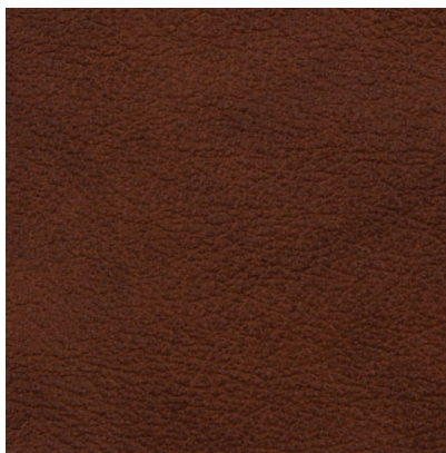
CHESTNUT BROWN (671)